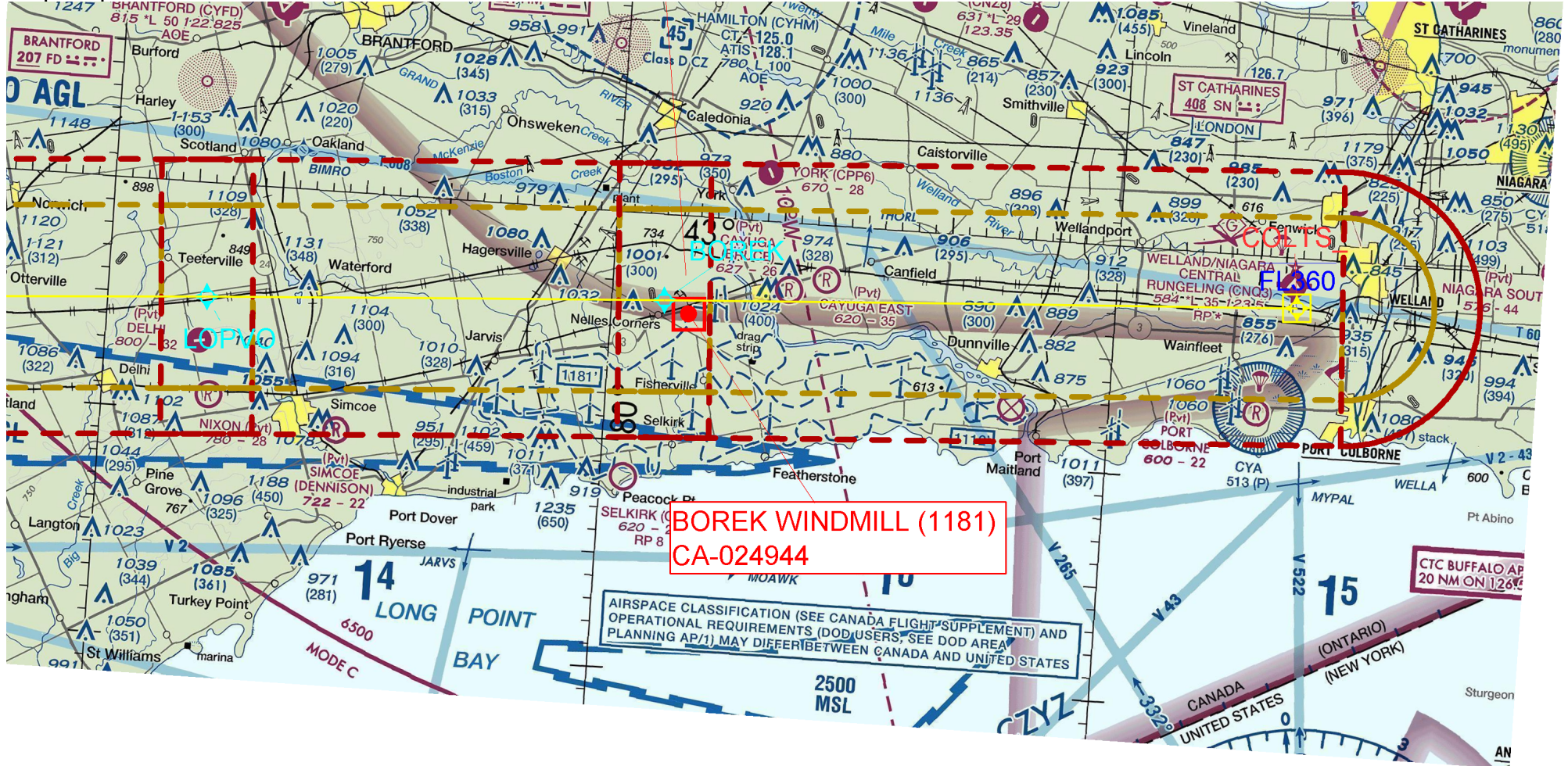
Graphic Depiction 2